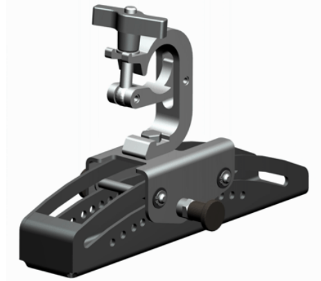
XD15 Universal bracket (Trigger clamp not included)